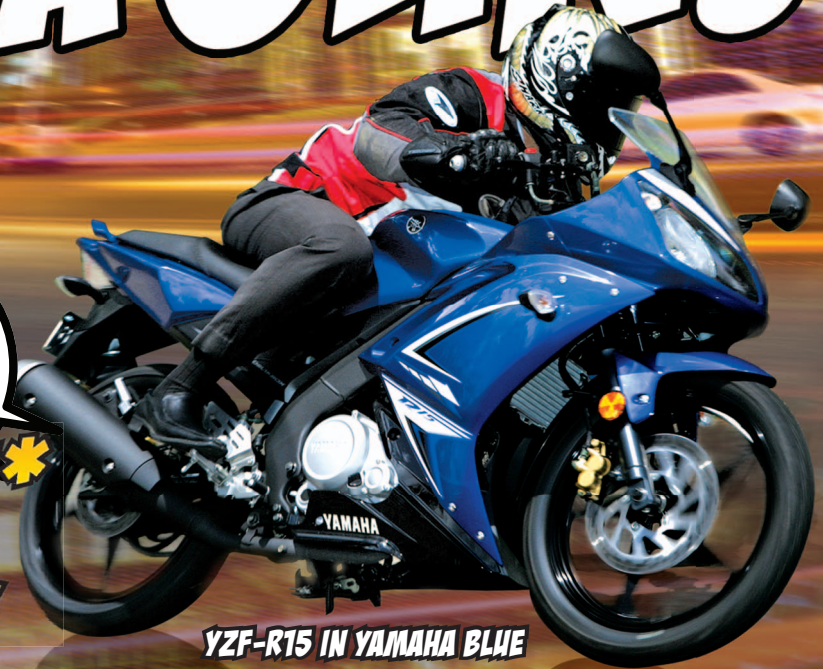
YZF-R15 IN YAMAHA BLUE