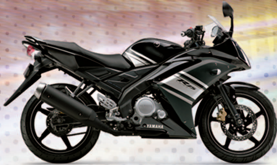
YZF-R15 IN MIDNIGHT BLACK